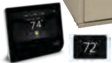
Control and Smart Sensor sold separately