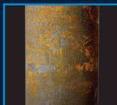
Top Competitor's Glass-lined Tank Very Heavy

Minimizes Scale Build Up Prolongs Tank Life No Need for Anode Rods Lightweight Construction