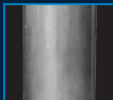
HTP's Stainless Steel Tank Lightweight