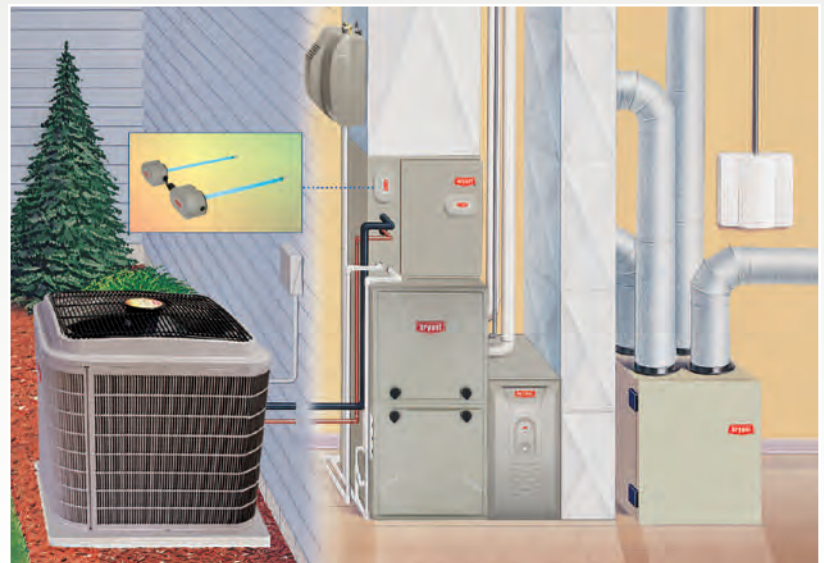
Air Conditioner and Gas Furnace System